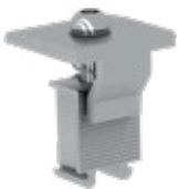
EC-M End Clamp