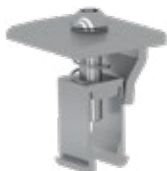
IC-M Inter Clamp

The PV-ezRack Inter and End clamps offer a simple, easy to use and robust fixing of the PV panels.