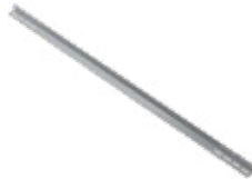
ER-AA-50/XXXX/50 Angle AL

Rear Leg Extension can be easily attached with Rear Leg 10° with a single screw, to achieve 15°.