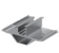
FL-AC/10 FL-AC/15 Front Leg 10°/15°

Click in installation, manufactured from aluminum offer excellent corrosion resistance.